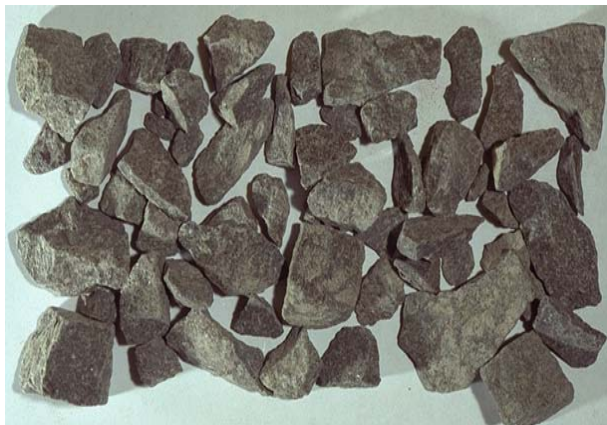
Limestone coarse aggregate