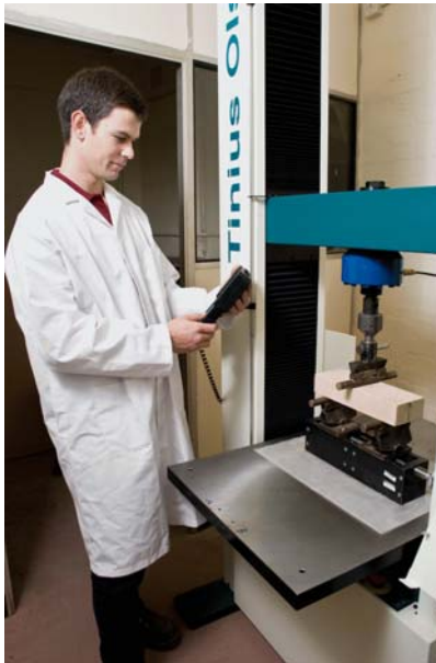
Flexural Strength Test