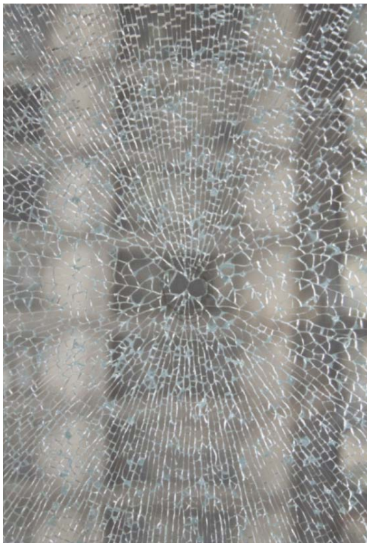
Spontaneous shattering of toughened glass

Sandberg offers expert services in these 'ancient and modern' materials, including toughened glass which is currently popular for atria and curtain walling, plastics in their various forms, the use of which is increasing rapidly and, of course, paints.